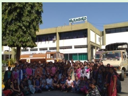
Karnataka Milk Federation

An Industrial visit was conducted to Karnataka Milk Federation, Mysuru and Regional Museum of National History, Mysuru on 19th January 2019.