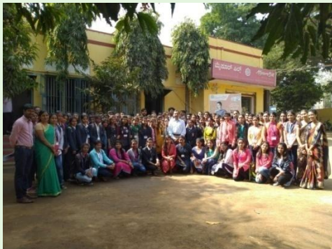
Silk Weaving Factory.

Industrial visit to Silk Weaving Factory and Sandal Wood Oil Factory, Mysuru on 17th January 2019 was conducted.