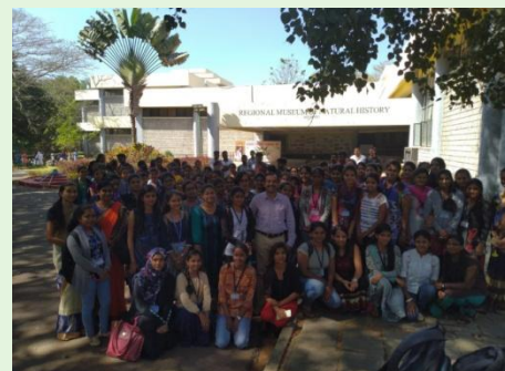
Regional museum of National History