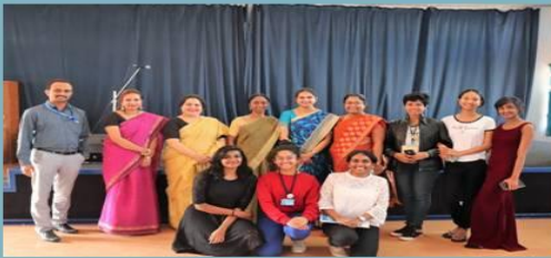
Character representation – Greek Mythology/ Super Natural elements