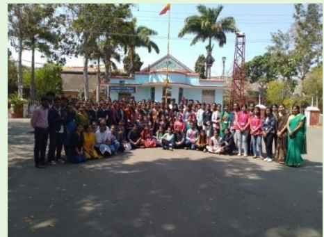
Sandal Wood Oil Factory

An Industrial visit was conducted to Karnataka Milk Federation, Mysuru and Regional Museum of National History, Mysuru on 19th January 2019.