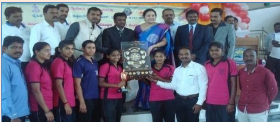
Women section: Overall Team Championship 2015-16 won by our College securing 30 points.