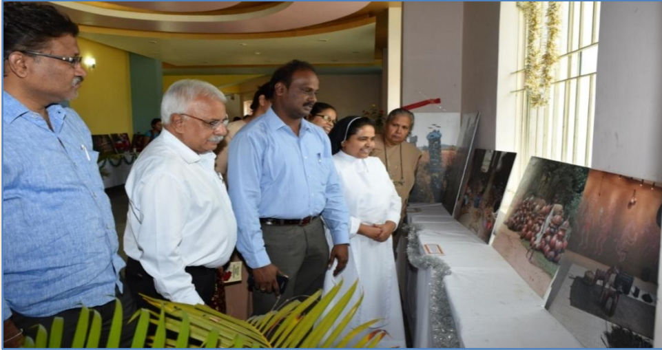
9. Gandhi Jayanthi was organised by the Department of History on 1 st October 2015.