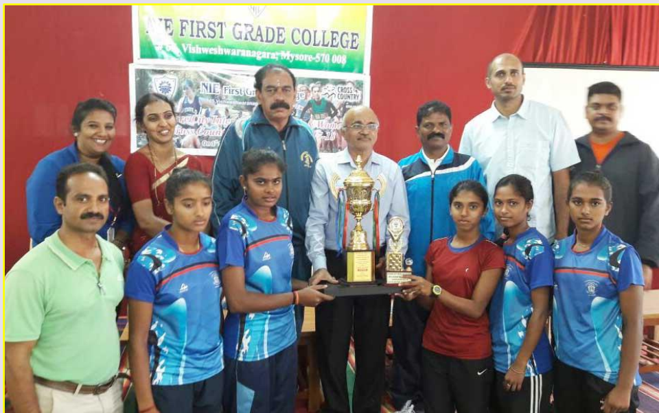
Team championship won by Teresian College, Mysore