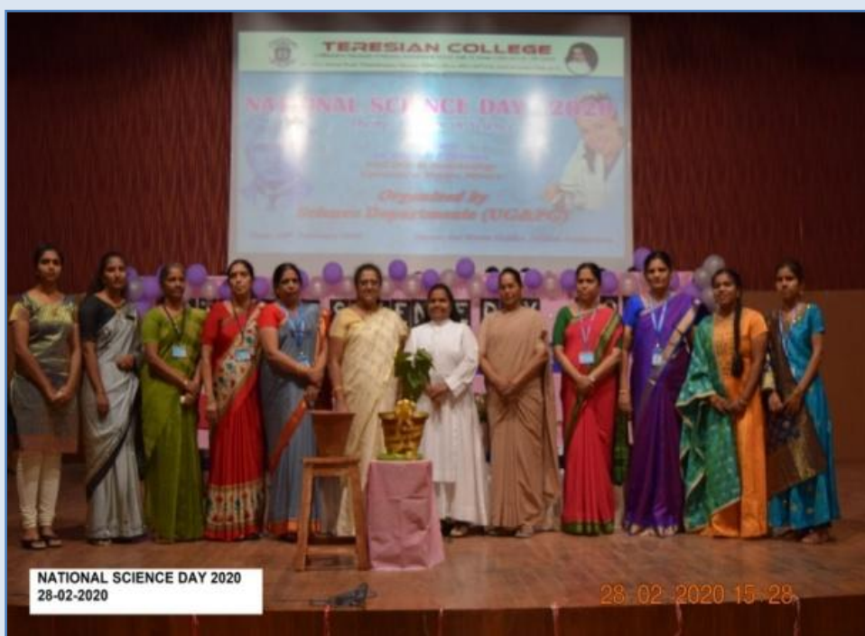
NATIONAL SCIENCE DAY 2020 28-02-2020

Science week was celebrated from 24th February 2020 to 28th February 2020. The theme for the week was “Women in Science”. Various competitions like sketching, singing, science carades, pick and speak, quiz, poetry, collage making, skit and ramp walk were held during the week. National Science Day was celebrated on 28-02-2020. It was organised by department of Physics to commemorate the discovery of the Raman Effect. 410 students participated in the programme.